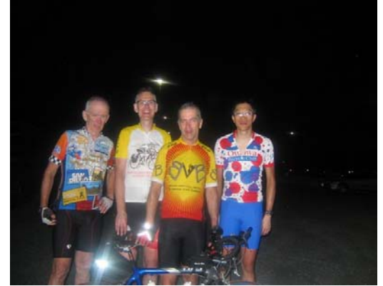
"Taking a break on the Coureur-De-Bois Brevet"