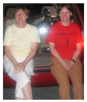
"The ride had one of the best support crews on the planet"

I was the neophyte who had the privilege of riding with three highlyaccomplished randonneurs, who have seen and experienced much in longdistance cycling. Their moral support gets more important as the kilometers tick by. This makes me think that I wouldn't want to ride such an event on my own. The presence of our generous 'domestiques' also demonstrated that I wouldn't want to ride such a brevet without support. It's simply too demanding. In fact, I shudder at the prospect of being stuck in the boondocks at night, exhausted, and