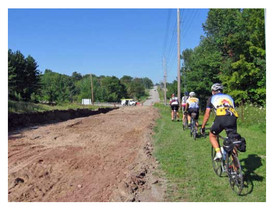
First road construction

We continued on, without the benefit of a bathroom, and rode fairly uneventfully into the first control at the Hockley Valley General Store. We arrived just before 10:00 am, having completed the 119 kilometers in just under 5 hours. The control was set up in the parking lot of the general store. We filled our bottles, got some snacks and went into the general store for more food. The control had an awesome selection of fresh bakery items. I left with a blueberry muffin. The next few kilometers wound through a very beautiful section of the Niagara escarpment. The area was highlighted by lots of trees, hills, and a pretty meandering stream. Leaving this area led to our first section of unexpected road construction.